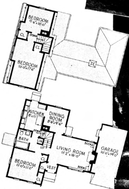
A house of Type G, built on a corner lot, is at right. It contains 18,258 cubic feet, and cost $6950 with land